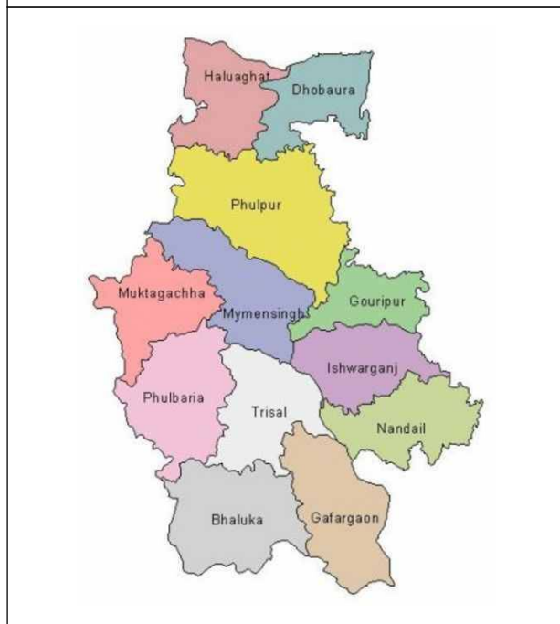
Figure 1: Collection Place of Fish

nutrition, Bangladesh Agricultural University, Mymensingh for biochemical composition