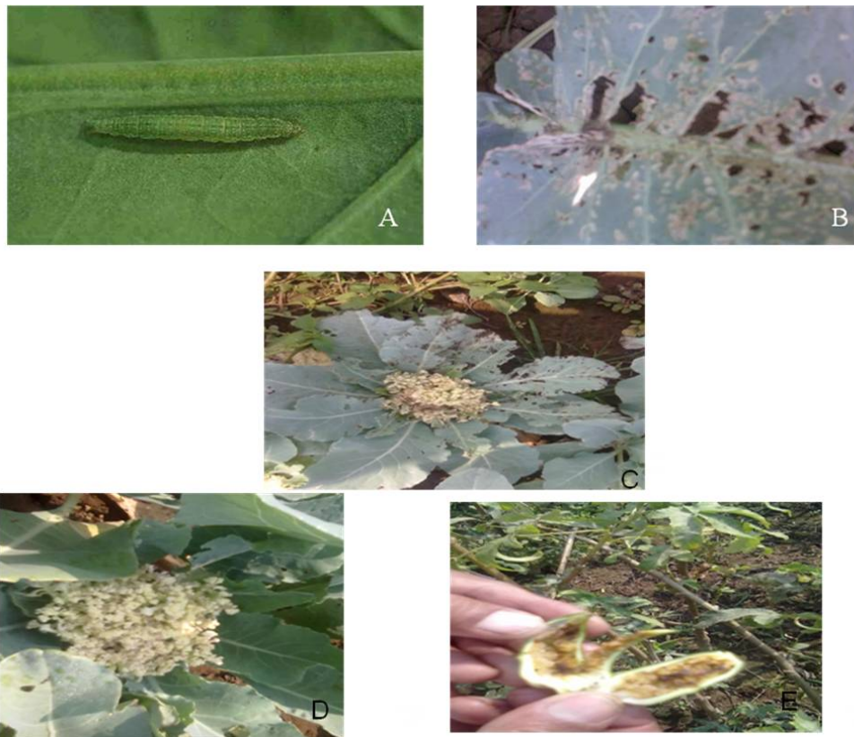
Figure A to E: Diamond Back Moth on Host Plant Figure B: Diamond Back Moth Chew Plant's Leaf Figure C: Pest is Making Host Plant's Fruit Ruined Figure D: Pest Affected Cauliflower Figure E: Showing Okra's Pest

activity of the leaves. Therefore they may reduce okra and cauliflower fruit yield (Figure D and E).