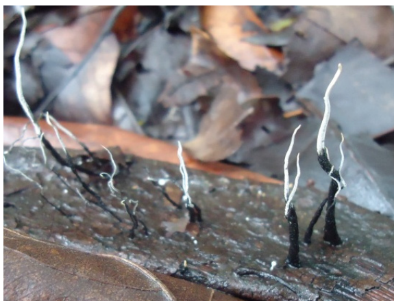
Figure 2: Xylaria polymorpha